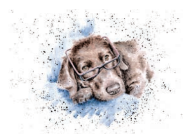
Labrador Bouncy • Eager to please • Loyal

The Labrador is the world's most popular dog; truly Man's Best Friend. With its gentle nature, playful personality and bright intelligence, it is no wonder that the Labrador is so loved. Perfect as a family pet, these adaptable, clever dogs are also prized as therapy dogs, detection dogs and sporting companions. Originally hailing from Newfoundland in Canada, their ancestors belonged to fishermen who had a deep reliance on their four-legged friends. Known as the 'St John's Water Dog', they were responsible for retrieving nets, ropes and even fish. Spotting their considerable talents, two English aristocrats brought a pair of dogs to England and bred them as shooting companions and soon realised that they had something pretty special... and the rest of the world wholeheartedly agrees.