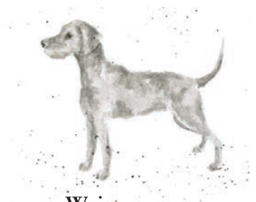
Weimaraner Wilful • Wise • Aristocratic

The Weimaraner is a beautiful and athletic dog. Its haunting, ghostly appearance is instantly recognisable with its velvety grey coat and amber eyes. The Weimaraner was originally bred in Germany as a dog for hunting large game such as deer, boar and bears and is an excellent all-round hunter and pointer. It was bred exclusively for the aristocracy and, as a highly-prized dog, it was kept inside with the families rather than outside in kennels. This has resulted in a dog with a strong need to be with humans – it is deeply unhappy without its companions. A lively and friendly dog, the Weimaraner has rightly earned a place in the hearts of dog lovers and makes a wonderful pet for those who can provide assertive leadership and lots of exercise.