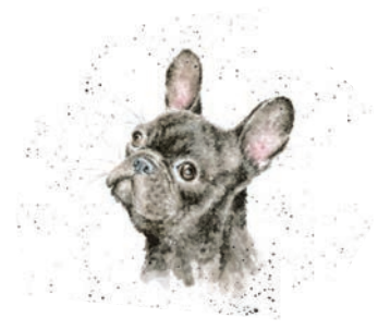
French Bulldog Mischievous • Entertaining • Expressive

The Frenchie is enjoying something of a resurgence of popularity, especially in towns and cities where this sweet little dog is well adapted to apartment life. Contrary to what its name would suggest, the Frenchie was first bred in England to be a companion, or toy version of the Bulldog. It was a particular hit with the lace makers of Nottingham, and when they emigrated to France to seek better opportunities, they took their little dogs with them, and that is where they adopted their French name. The Frenchie lavishes love on its human friends, and demands to receive it in return. Funny, mischievous and gentle, with its comical bat ears and big, expressive eyes, there is no wonder that this breed is enjoying a renaissance.