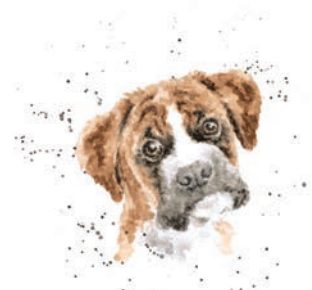
Boxer · . Fun • Fearless • Animated

The handsome Boxer is unforgettable with his distinctive face, sleek body and clown-like personality. Originally hailing from Germany, the Boxer was first bred for bull-baiting and was later put to use as a butcher's dog, where its strength and agility made it ideal for herding and controlling cattle in slaughterhouses. Despite its powerful looks, Boxers are gentle dogs – bright, energetic, playful and good with children. They are well known for being patient and protective. The Boxer name is a bit of a mystery – some thought that it arose from the dog's habit of standing on its hind legs and 'boxing', but the truth is unknown.