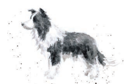
Border Collie Clever • Strong-minded • Trustworthy

The beautiful Border Collie, with its distinctive markings is the brightest of all dog breeds, being highly intelligent, energetic and athletic. Famous for excelling in doggy sports and sheepdog trials, the Border Collie is the high achiever of the dog world. Originally bred for herding sheep in the hilly borders of Scotland, obedience and intelligence were the most prized characteristics. It is thought that all Border Collies alive today can be traced back to a dog named 'Old Hemp', born in Northumberland in 1893. Though black and white Collies are the most common, they can come in a wide variety of colours including tricolour, red, brindle or blue. Although they make wonderful companions, they need a lot of exercise and mental stimulation to remain healthy and happy.