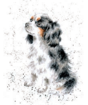
Cavalier King Charles Spaniel Attentive • Sweet-tempered • Gentle

This little dog has a royal heritage and no self-respecting court lady in Tudor or Stuart times would be seen without one. The direct ancestors of the 'Cav' were particularly loved by their namesake, King Charles II. He was rarely spotted without several of these handsome little dogs at his heels. The Cav has four recognised colours – the equally regal sounding Blenheim (chestnut and white), tricolour, black and tan, and ruby. There is no wonder that the Cav has become such a popular family pet. Friendly and fun-loving, equally happy with a romp around the garden and a snuggle by the fire, it makes a wonderful all-round companion.