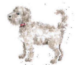
Cockapoo Excitable • Wilful • Affectionate

Cockapoos are hybrid dogs, created by breeding a Cocker Spaniel with a Poodle. They love their owners unconditionally and will want to play with them from dawn until dusk. They are intelligent and fun-loving, but don't shed quite as much hair as a Cocker Spaniel. The Cockapoo is not recognised as a distinct breed but irrespective of this is a hugely popular pet combining the loving and outgoing personality of a Cocker with the intelligence and hypoallergenic coat of a Poodle. However, being a hybrid, its character traits and appearance can be hugely variable, with some being more Poodle or Cocker-like than others.